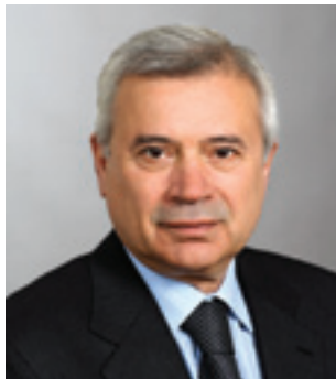
Vagit ALEKPEROV, President of OAO "LUKOIL"

Open Joint Stock Company "Oil company "LUKOIL" (hereinafter also OAO "LUKOIL", the Company, LUKOIL) is moving purposefully to achieve its established goals – to reinforce positions of one of the leaders in the world's oil-and-gas industry, to become a global energy company, and to comply with the highest standards in health, safety and the environment.